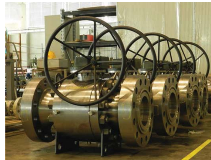
10" #1500 "TMBV" for natural gas service.

We also participated in the execution of the Gas Storage Bergermeer plant in Alkmaar, The Netherlands which is now operated by TAQA (Abu Dhabi National Energy Company PJSC). Long-term analysis shows that the decline in gas production will create a substantial decrease in flexibility in the market. To fill this gap TAQA has developed Europe's