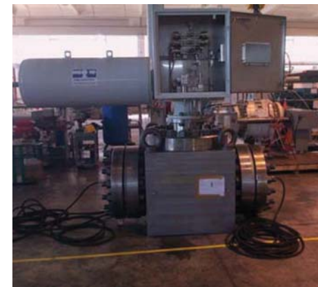
Forged 18" #1500 Top Entry H.I.P.P.S. - SIL III Ball Valve under performance test.