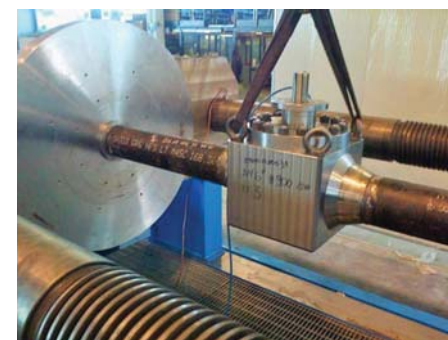
Forged Top Entry 6" #900 BW with pups under hydro-testing.

We also participated in the execution of the Gas Storage Bergermeer plant in Alkmaar, The Netherlands which is now operated by TAQA (Abu Dhabi National Energy Company PJSC). Long-term analysis shows that the decline in gas production will create a substantial decrease in flexibility in the market. To fill this gap TAQA has developed Europe's