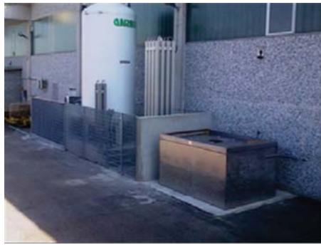
Cryogenic Testing set-up.