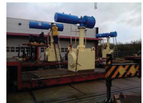
30" #1500 Forged Side Entry Ball V.