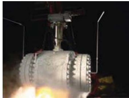
30" #600 Cryogenic Valve under testing.