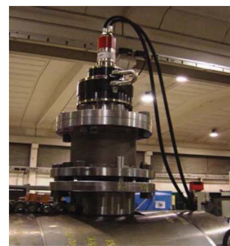
Torque test with Norbar torque tool with capacity up to 100000 Nm.

Our testing area is fully equipped with test benches for standard API 6D testing and facilities for HP gas testing, Fugitive Emission, torque testing, Cryogenic and Fire safe testing along with Metrological laboratory.