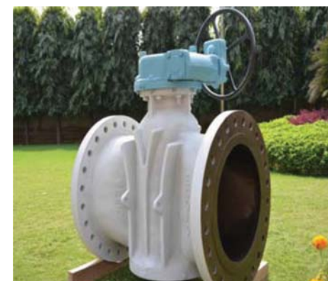
20" 300# Plug Valve.