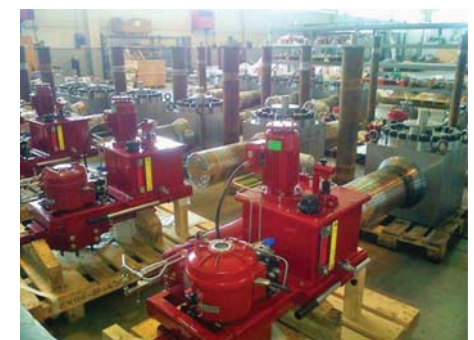
Electro-Hydraulic actuators and 12" #900 Top Entry Ball Valves.

and, not least, lip seals. Thanks to the expertise and commitment of our staff the job was properly executed and delivered on time.