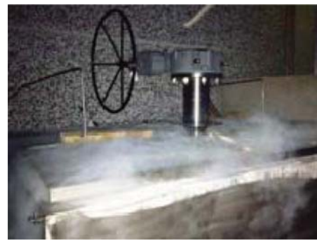
20" #600 Cryogenic Valve after testing.

Arabia, under Aramco specifications. The valves were designed, produced, tested and shipped in a time span of 10 weeks.