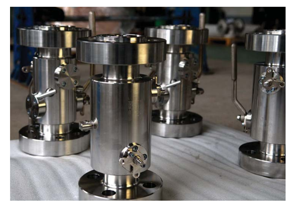
F316 1.5 inch 2500lb Double block & bleed valve.

PONHAN Machinery primarily focuses on OEMs, especially in the chemical industry and off-shore industry. Export accounts for 60% of their total business, and almost 40% is OEM business. Consistent quality, rational price and reasonable lead time has enabled PONHAN to develop reliable business partnerships with many OEM clients, EPC clients and end users. Severe application conditions of high temperature, high pressure, high corrosion or cryogenic applications ranging from petrochemical, offshore, chemical, oil & gas, power plant and, shipyard to long distance pipeline and other industries are where the main business emanates from. Successful high alloy valve manufacturing stems from qualified base materials together with precise machining and forging and CNC machines ensure this high quality standard. Product types available today range from ball, globe, check, gate, butterfly and plug valves to tank bottom valves, sampling valves, double block & bleed valves, strainers and sight glasses. Valve materials used include titanium, nickel alloys, zirconium, nickel-aluminum-bronze and (super)duplex, and alloy 20#, 904L, 310S,