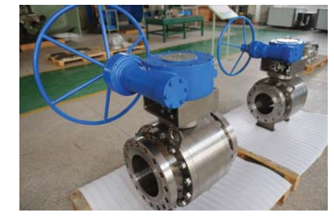
Ball valve 12 inch 300lb titanium Gr. 3.

the latter have the expertise to handle certification and audits required by large clients such as Shell or BP. PONHAN's products are widely utilized in a great variety of applications and projects in oil & gas, chemical and petrochemical companies. PONHAN also regularly supply products to the hydropower, thermal power, nuclear, water treatment and desalination industries.