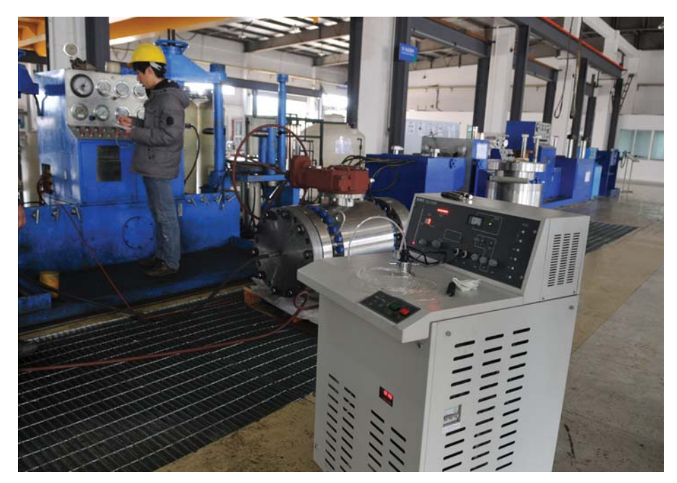
Carrying out low emission testing.

In order to support their global business, PONHAN uses three separate distribution channels – direct to end-