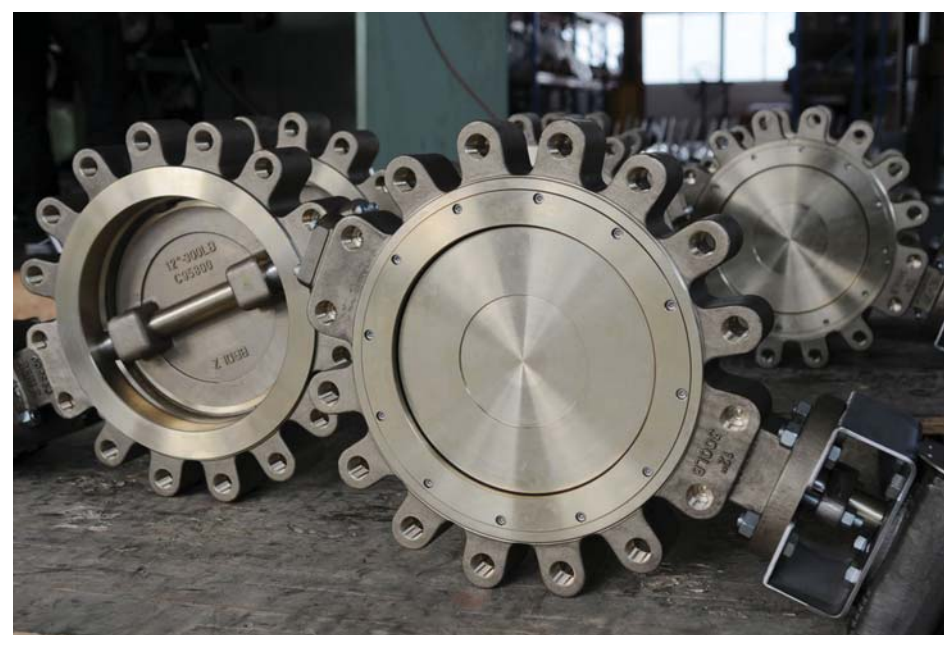
Nickel-aluminium-bronze butterfly valve.

Says Mr. Shen: "Quality is everything to us. Our objective is to always offer quality and service one step beyond the customer's expectation. We believe the customers who use valves in critical applications expect zero defects. To achieve this objective, we implement standardized working instructions and procedures. In addition, third party verification and end user approvals present an opportunity for improving quality on a daily basis. So far, we have received ISO 9001-2008, CE-PED, API 6D and API607 certifications. We also have the ERP system which allows us to handle both mass production and tailor made small orders as it can track every detail of the valve components by granting each its own unique serial number (ID). Not only are the raw materials and outsourced spare parts tracked, but also all the procedures on the production