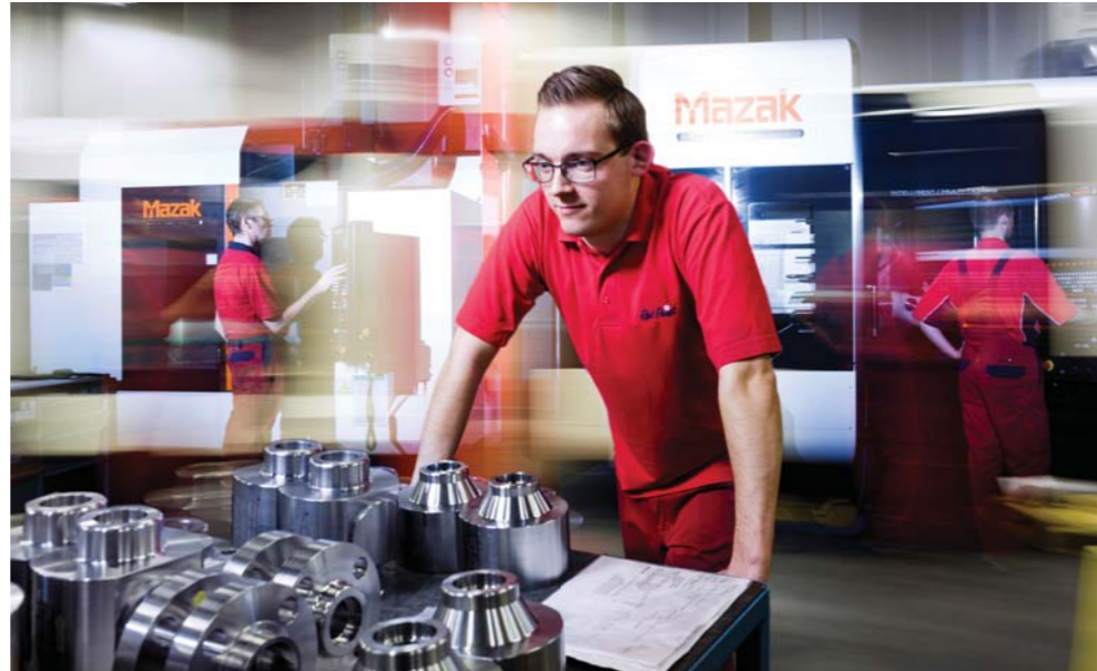
Taking the utmost care to avoid damaging any methodologically to ensure valves are built to