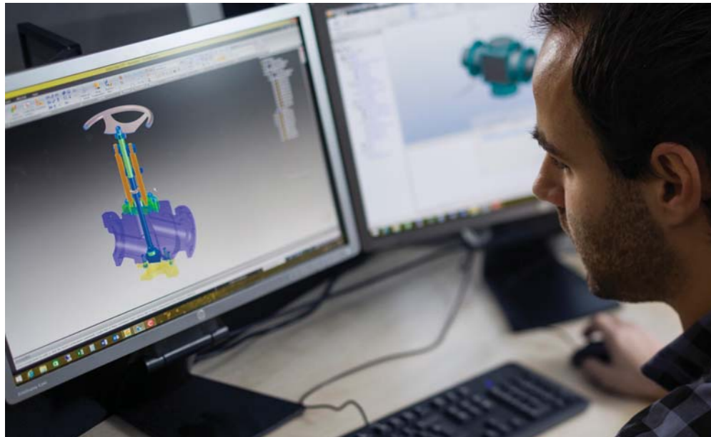
Extensive engineering checklists ensure all valves fully meet client expectations