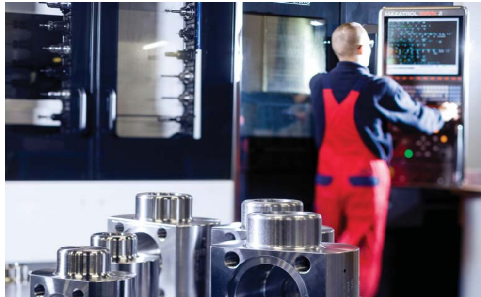
State of the art CNC machines facilitate user