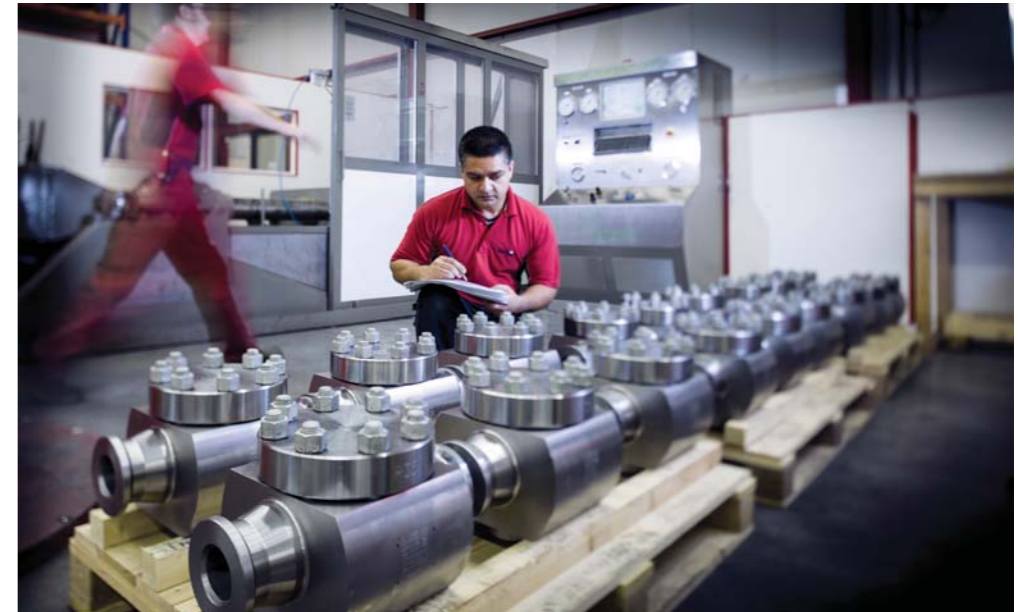
Valves undergo a thorough final inspection before shipment to customers.

prevent problems and delays later on." This team maintains very short communication lines with other departments to make sure that Red Point has the materials and production capacity needed to properly fulfill each and every order. "Every quotation we provide is based on realistic and achievable delivery times. Clients put absolute faith in our quotes and we do not want to damage that trust. This is also why we have invested in significant stocks of raw materials, to ensure immediate action if required."