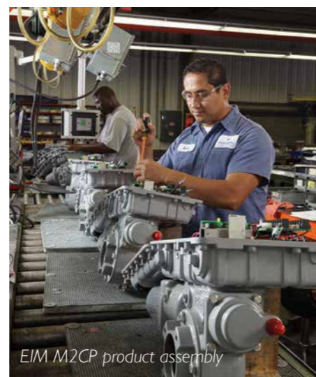
EIM M2CP product assembly

This process has been part of EIM design in the last 50 years and it has provided the customers ever since with flexibility to implement changes to their process without having to totally change out the actuator in some cases. "The Gold Seal quality standards and concept is adopted and resonates right through the manufacturing process and into our WACC where a fair degree of integration and automation takes place, and definitely at customer locations where site commissioning work is performed. And, with Emerson, we can put this service globally into all our facilities, offices and partnering with our distributor to ensure that the customer receives the brand promise that Emerson Process Management and EIM carries every time they choose to do business with us. I expect that this will help us gain customer loyalty which we must earn." Specifically, from the service perspective, all service and maintenance work that is to be delivered to the customers needs to be done by personnel that