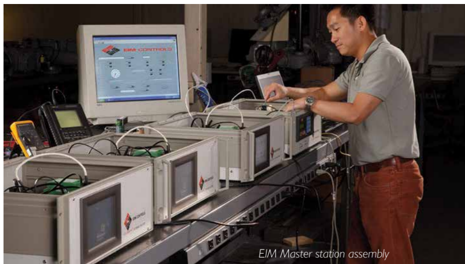
EIM Master station assembly