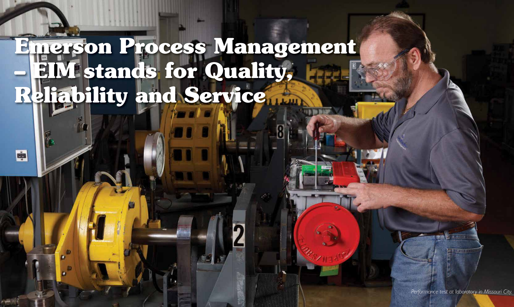
Performance test at laboratory in Missouri City.