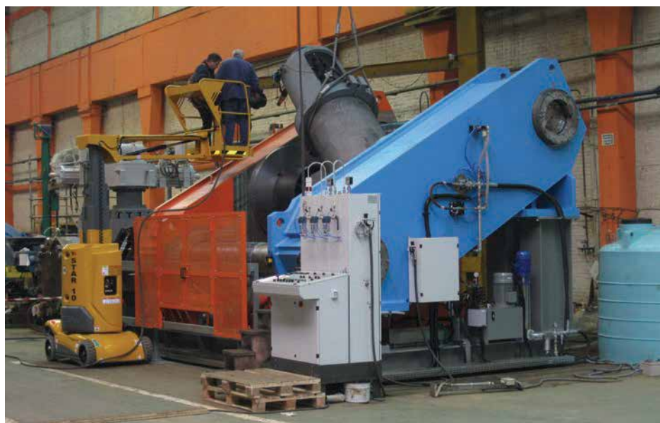
Italcontrol staff working on a horizontal test unit which is suitable for 5000 tons.

And he goes on: "Let me give you an example: A potential customer will compare our products to those offered by other companies across Europe which is a logical process and I would do the same thing if I was them but even if our prices are in some cases higher than some of our