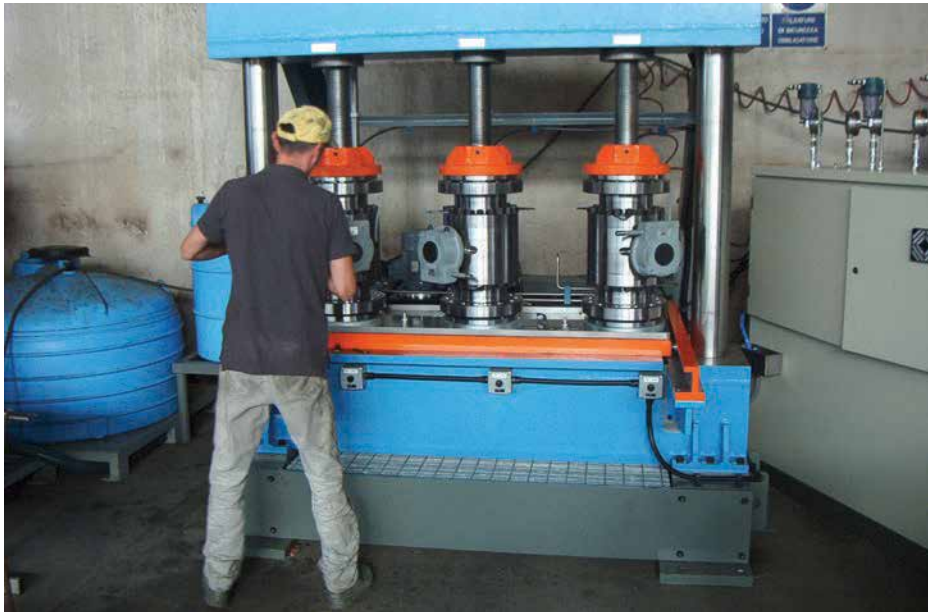
A multi-station vertical test unit which can test 3 times 120 tons.