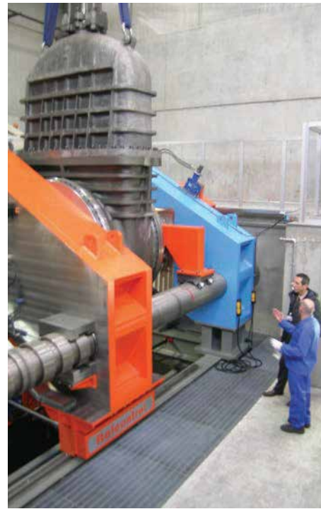
A 4000 tons test unit.