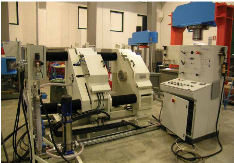
A 200 tons test unit for valves that are used in nuclear applications.

the neighbourhood of Italcontrol, there is the possibility to perform tests on valves on a subcontractor basis. "This sister company working with Italcontrol test benches is able to test up to 32" valves and gives to us a know-how about valve testing and although they are not a manufacturer or service/repair company, they know exactly how to work with these benches in order to get a valve tested, approved and released by a third party inspector which is very important for our customers. We know that these inspectors are wholly focused on checking the valve quality, leak tightness and all technical requirements