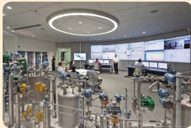
The Emerson Innovation Center in Austin, Texas provides global leadership for control systems development, integrated operations consulting, project execution and human centered design.