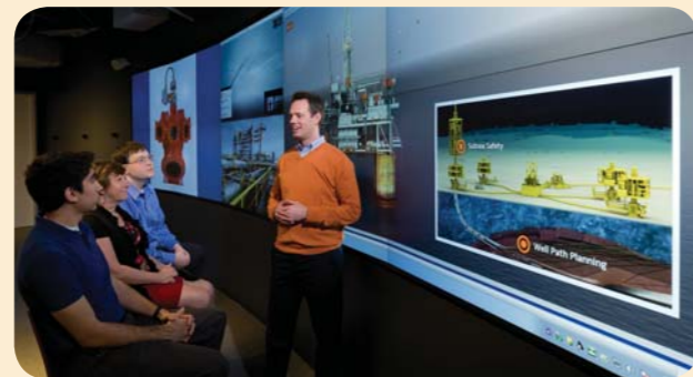
The Collaboration and Solution Center in Houston, Texas parallels other similar centers in Emerson Process Management that deliver answers so users can greatly improve their operations.