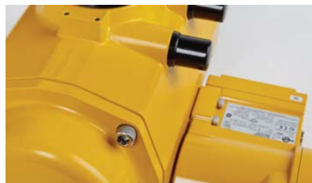
FieldQ Exd eliminates complexity and offers compact solution.

Simplicity, reliability and compactness all help define FieldQ™ rack and pinion actuators. Because of its modular design, FieldQ reduces the complexity of service, maintenance and spare component inventory. The newest FieldQ innovation is an ATEX Ex-d rated module. This solution houses electrical connections, switches and pilot valves in a single housing, with field-replaceable cartridges that allows flexible and modular service options. In addition it includes a non-intrusive end stop adjustment that allows for service without intrusion into the hot electrical compartment. Its side mounted controls and compact physical profile allows FieldQ to be direct-mounted to the valve for use in applications where tight piping runs and