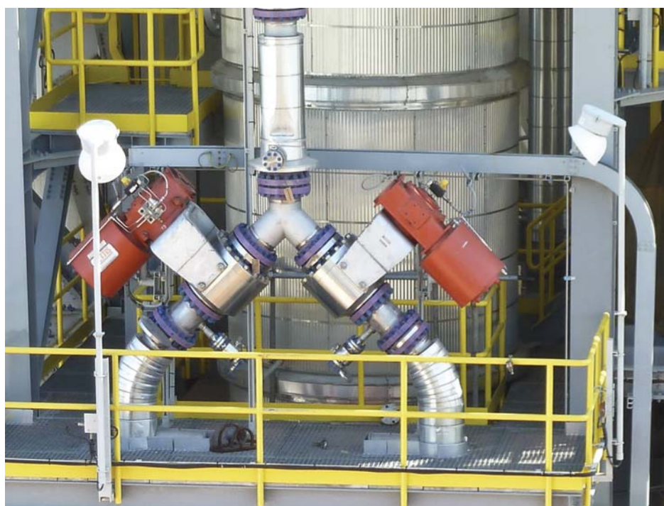
Two 10" Class 150, super duplex, stainless steel Velan Securaseal valves.

Once the ore is separated from the earth's crust it is transported from the extraction pit. In the case of precious and semi-precious metals (gold, nickel, etc.), the desired mineral must be separated from other elements and impurities that