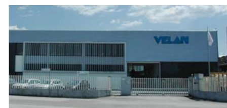
Velan ABV S.p.A., Head Office and Plant 1 Lucca, Italy.

In 2011, Velan acquired ABV S.p.A., an Italian company that mainly targets the oil and gas industries for off shore and subsea applications. It has expanded into power generation, geothermal processes, and liquefied natural gas (LNG).