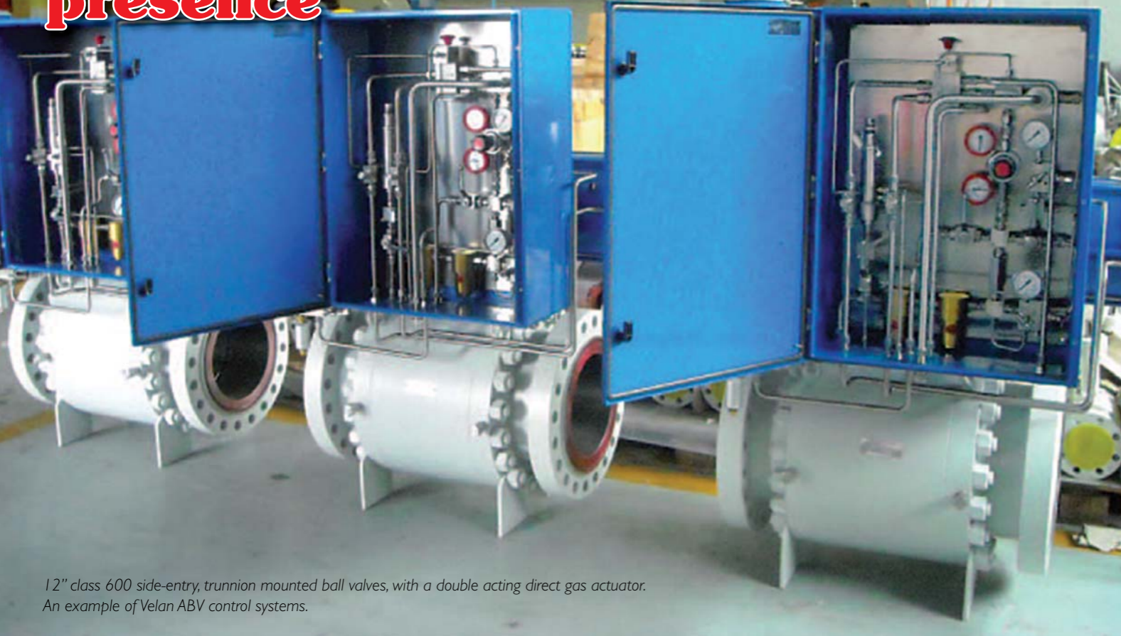
12" class 600 side-entry, trunnion mounted ball valves, with a double acting direct gas actuator. An example of Velan ABV control systems.